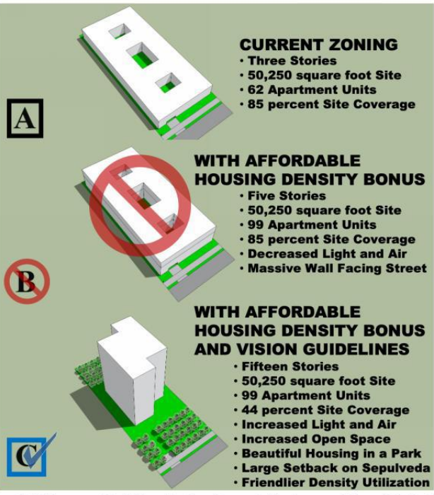
Figure 8. Panel A Shows a Building Under Current Zoning and Panel B Under a Density Bonus, While Panel C Shows an Alternate High-Rise Concept with Maximum Open Space

Sepulveda as a Grand Boulevard – Sepulveda Boulevard's west side overlooks the Sepulveda Basin and is clearly separated from properties on the east side. This unique area is the only one where we recommend high-rise buildings, as shown in Figure 8 . While meeting all other guidelines, high-rise buildings would also employ 40-foot landscaped setbacks with double rows of London Plane trees (Platanus acerifolia Columbia) along Sepulveda, to create a Grand Boulevard.