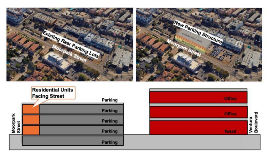
Figure 7. Parking Structures Could Be Built in Existing Parking-Zone Areas and Layered with Attractive Street-Facing Facades

The City should convince landowners of P-zone properties that they can financially benefit from such developments, as they would become major community benefits. The City should also encourage project developers to establish shuttle services for their tenants to and from remote parking structures.