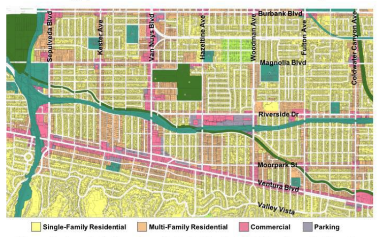
Figure 1. Our Guidelines Benefit Both Mandated Higher-Density Housing and All Housing Across Sherman Oaks

We support the concept of affordable housing incentives and their higher-density mandate, and realistically believe that higher-density housing will become the norm across all areas of Sherman Oaks and Los Angeles. Our six Guidelines then become even more critical because they create well-designed housing while enhancing the livability and lifestyle of our community. The color legend of Figure 1 details the four types of zoning in Sherman Oaks to help everyone understand how higher-density housing could impact our entire community in the future – and why our Guidelines must apply across this entire Sherman Oaks community.