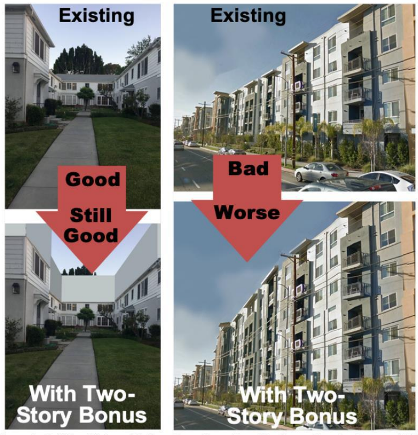
Figure 3. Building Higher with More Open Space Does Not Create Negative Impacts (left), While Building Higher with Minimal Open Space Creates Negative Impacts (right)

Higher density requires more than minimum open space. Building higher to increase density can promote livability if done correctly, as shown on the left in Figure 3 . Alternately, building higher with minimal open space creates light wells that limit light and air at lower levels and confronts communities with massive walls of building, as shown on the right in Figure 3 . Such intelligent open space planning will establish better living environments for all residents even as density increases.